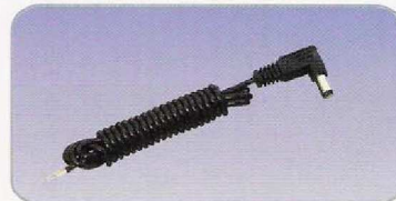
E-DC-6 12V Cable Without Adapter Plug